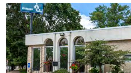
St. Paul NUWAY Counseling Center