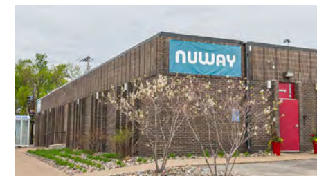
3R's NUWAY Counseling Center