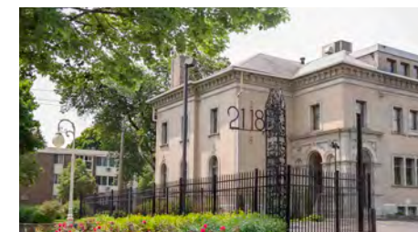
2118 NUWAY Counseling Center